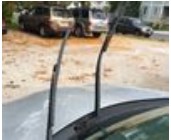
Changing Windshield Wipers by ENGL314G14