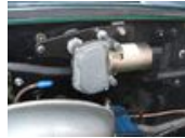
Classic car windshield wiper vacuum motor replacement by grandpajoe