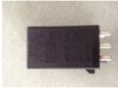
Mercedes W123 Windshield Wiper Relay Repair by Lyapunov