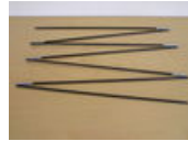
How to repair tent pole elastic cord (Re-thread) - The Easy Way by chaoticandrandom